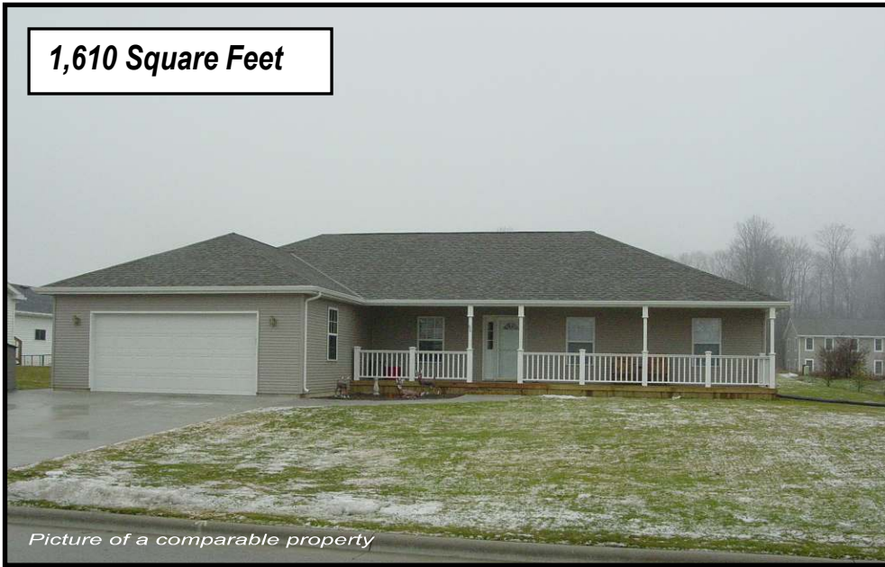
Picture of a comparable property