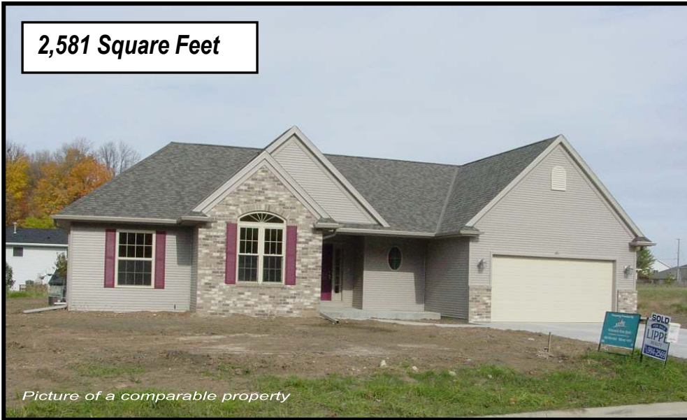
Picture of a comparable property